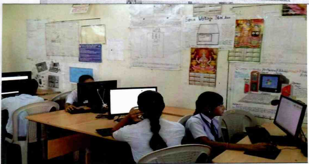
Photograph of functional ICT Lab:

Headmaster Narendra Nath Bidyapitha Maidoli