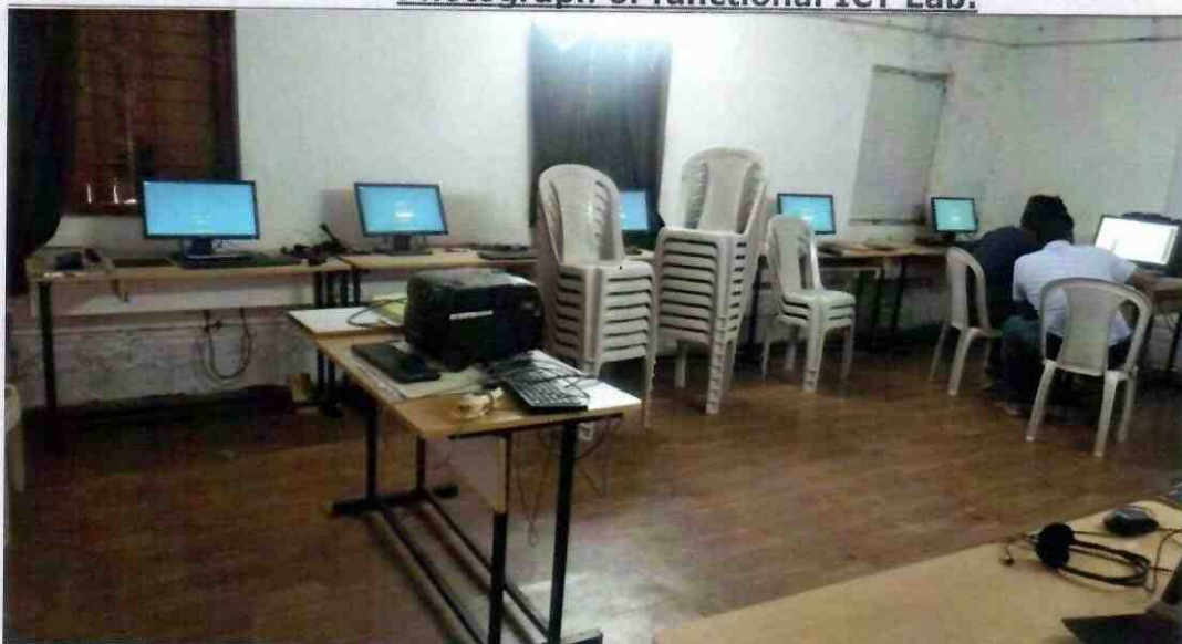
Photograph of functional ICT Lab:

N.S.A. 12.09.19 I/C Headmaster Stamp & Signature of H/M: Bagudi, Balasore