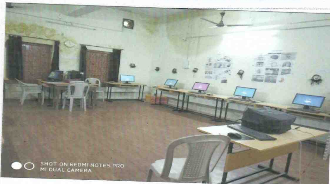
Photograph of functional ICT Lab:

12.8.19 Headmaster Stamp & Signature of HM Tora High School, TORA