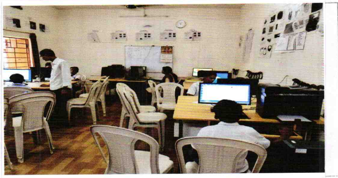
Photograph of functional ICT Lab: Dist-Boudh

[Signature] Stamp & Signature of HM Ramagarh Nodal High School Dist-Boudh