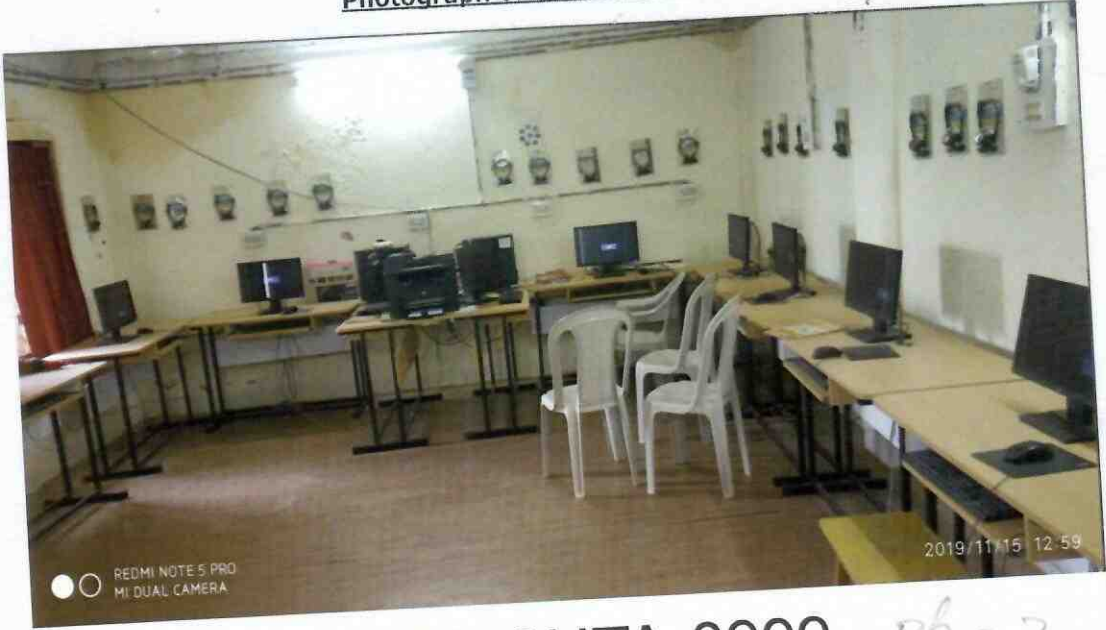
Photograph of functional ICT Lab:

[Signature] 21/08/2019 Stamp & Signature of Gadachapur High School CUTTACK