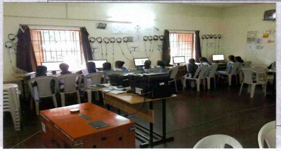
Photograph of functional ICT Lab.