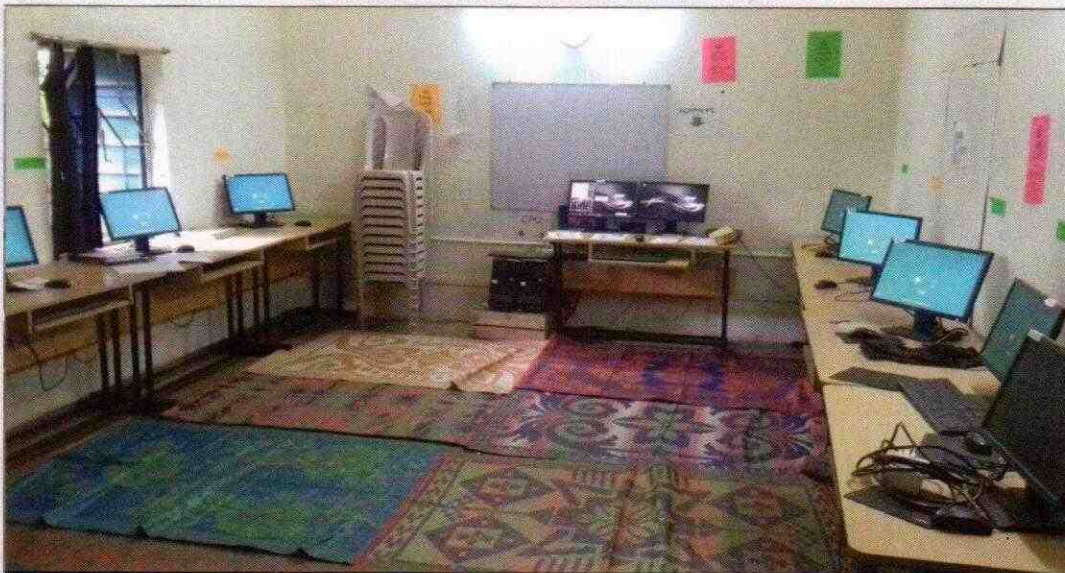
Photograph of functional ICT Lab:

Kandore Govt. Nodal High School At - Kandsore, P.O. - Talgaon, Dist - MB.