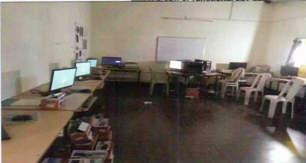
Photograph of functional ICT Lab:

[Signature] Headmaster in charge Stamp & Signature GPM School Godapalasa