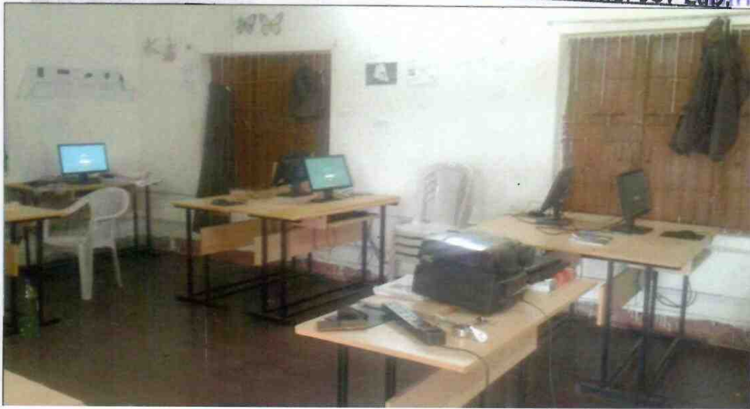
Photograph of functional ICT Lab:

Stamp & Signature of HM Govt. High School, Dairipalli, Dist-Nayagarh