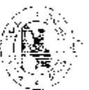
Table no. 1

FF.2.3 is 'No' Pls. give details in the below table